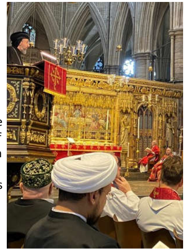
Archbishop Angelaos in Westminster

https://soundcloud.com/archbishopangaelos/meeting-zacchaeus-sermon-at-westminster-abbey