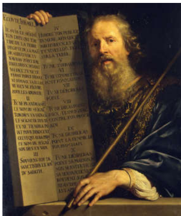
Moses with the 10 Commandments Philippe de Champagne (1648)