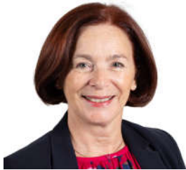
Senator Berthet, who represents the Savoie Region

After a lengthy and quite animated debate in the French Sénat on the 18 and 19 December, the new French Law on Immigration was approved still containing the clause which will permit British second-homeowners to spend up to 180 days in France at any time during a period of 365 without the need to split their stays into 2 periods of 90 with a gap of 90 days in-between.