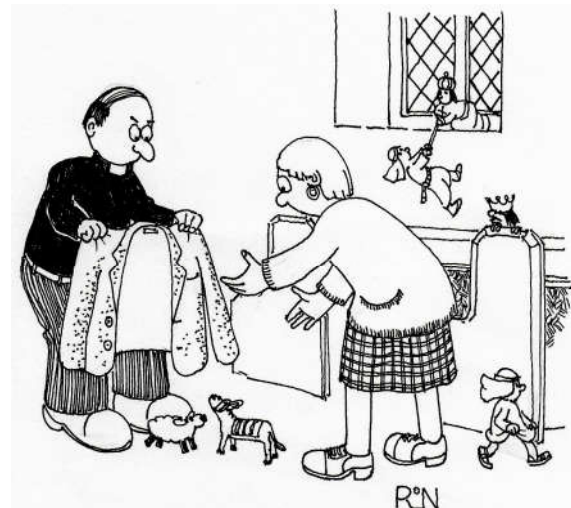
GETTING THE CRIB CHARACTERS BACK INTO THE VESTRY CUPBOARD AFTER CHRISTMAS WAS NEVER AN EASY JOB